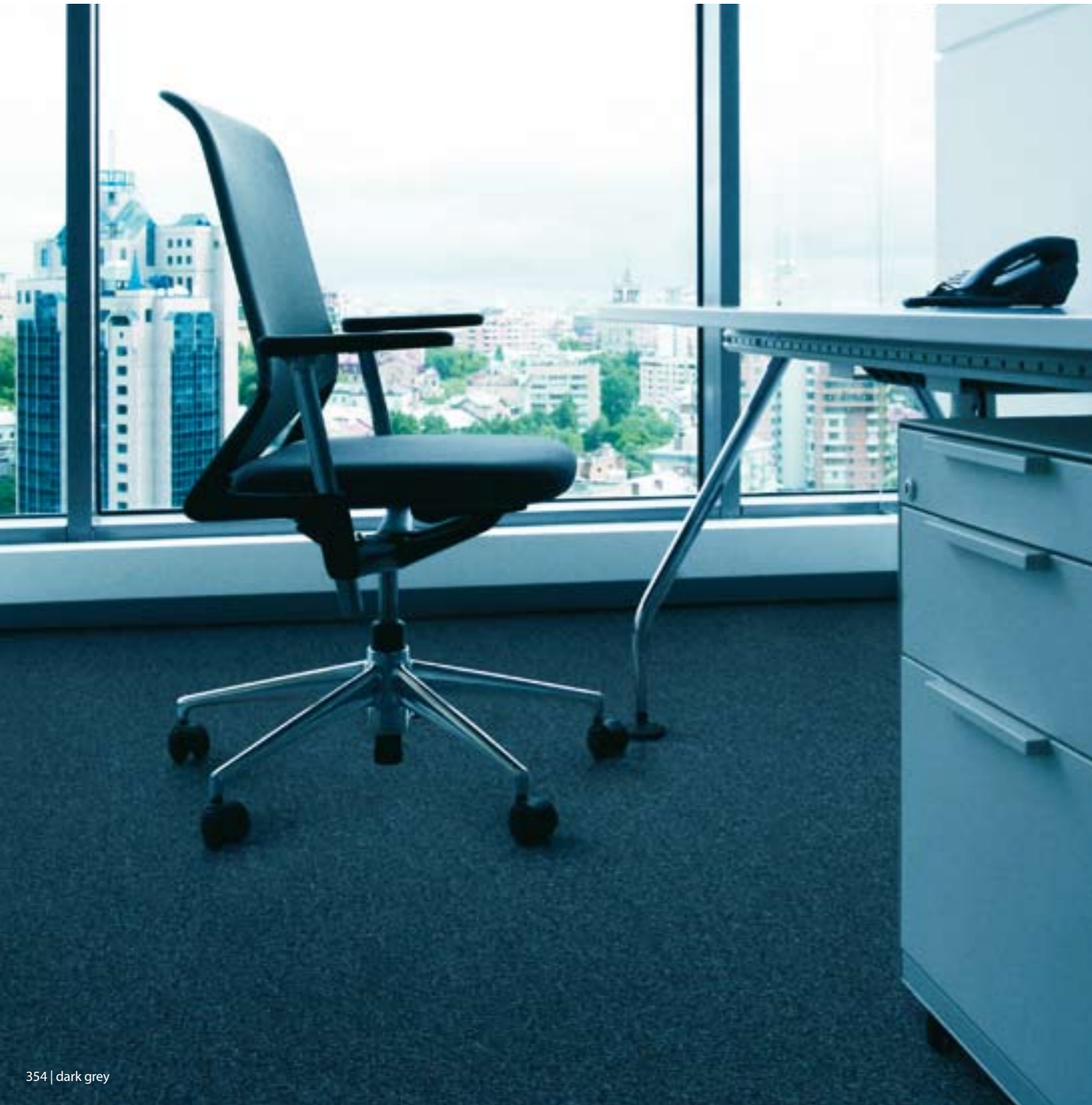
354 | dark grey

Suitable for every type of commercial installation, Tessera Basis fits throughout the building, wherever an attractive and hardwearing modular floorcovering is required. Manufactured from 100% Aquafil nylon, it has the resilience and durability needed to contend with the heavy wheeled traffic conditions often found in busy environments.